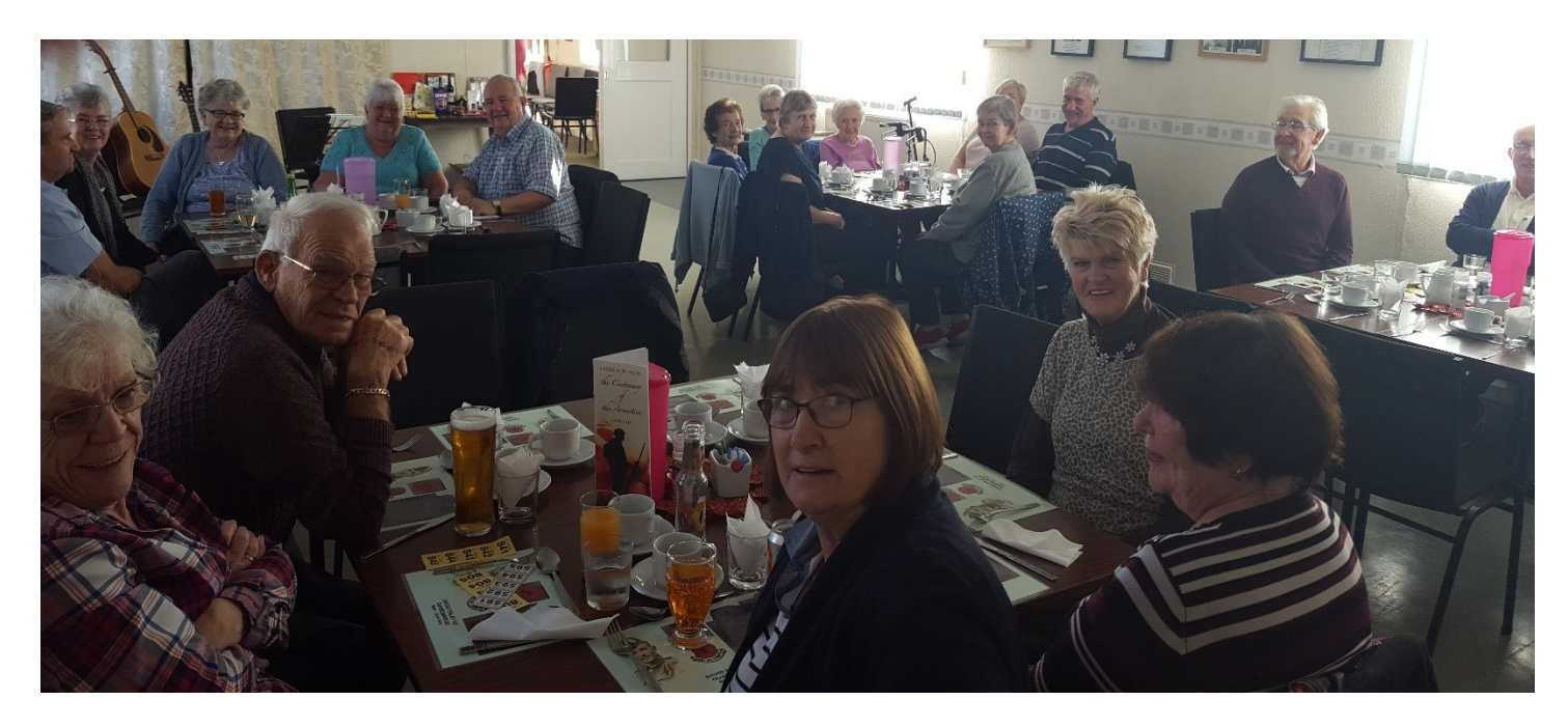
Some of the diners at one of the trust's Bite 'n' Blether sessions

The trust is looking forward to working with all parties who have an interest in the village. At present we have six directors and approximately 60 members.